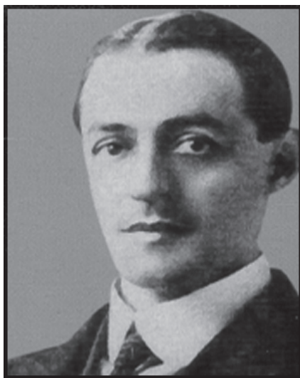
ARTHUR W. PINK (1886–1952)